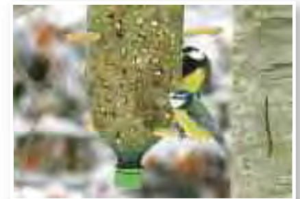
Tits on feeder

Check www.naturedetectives.org.uk for lots of activities.