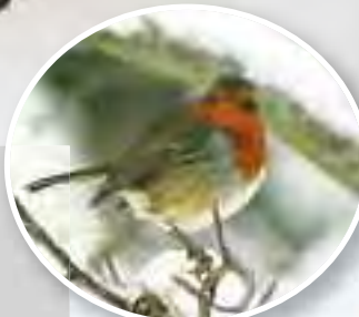
Robin on branch

Four main types: Waterfowl, Birds of Prey, Perching, and Flightless Birds