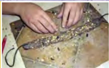
Making clay bird feeder in St Joseph's JNS, Tullamore.