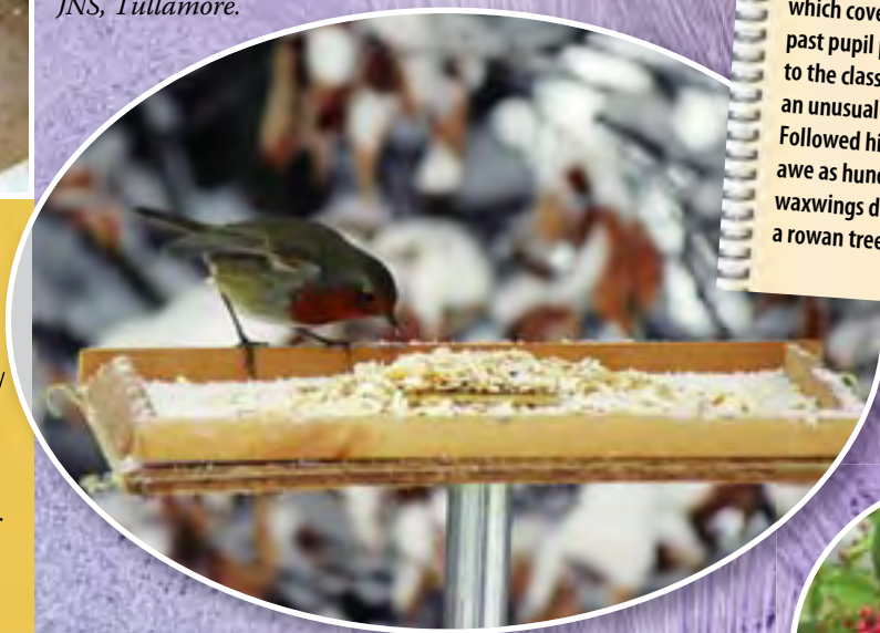
Robin on bird table – Cormac Madden

✳ Stratify holly berries. Young holly trees are always popular at school plant-sales. See www.schooleartheid.ie/pdf/intouch/Zoom_in_on_hollyandIvy.pdf