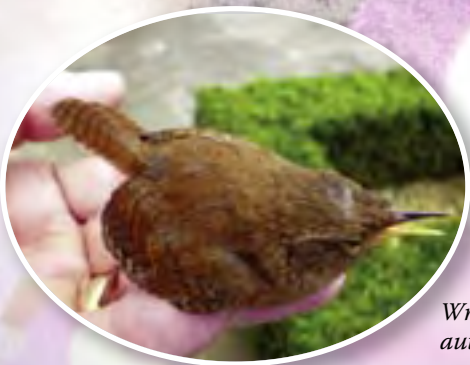
Wren on author's hand

It's the month of rest. Nature closes down. It's a good month for children to study birds.