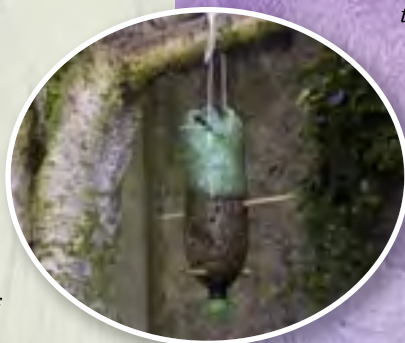
Recycled birdfeeder – Eamon O Murchú