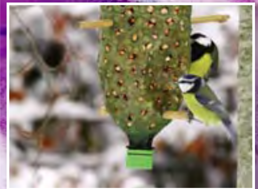
Tits on feeder